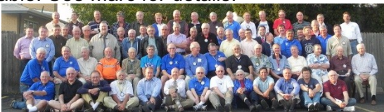
100% DAY 2012

2012 100% Day Photo Available: Marc Goodbody has reminded us that the 2012 photos is still available. See Marc for details.