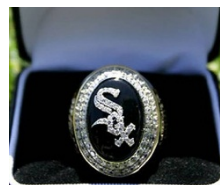
Chicago White Sox