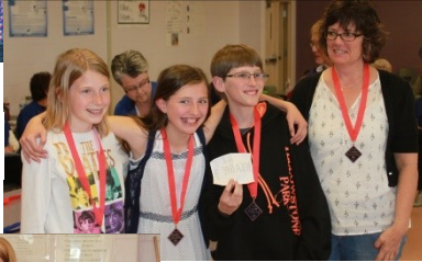
2 nd place Lowry Elementary: Tri-Brainers