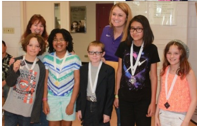
3 rd place Bradley International: Brain Bowl Champions