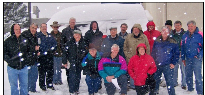
The hardy bunch, but of course some are missing.