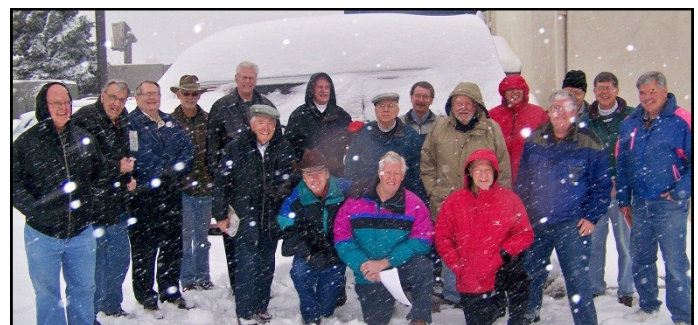
The hardy bunch, but of course some are missing.