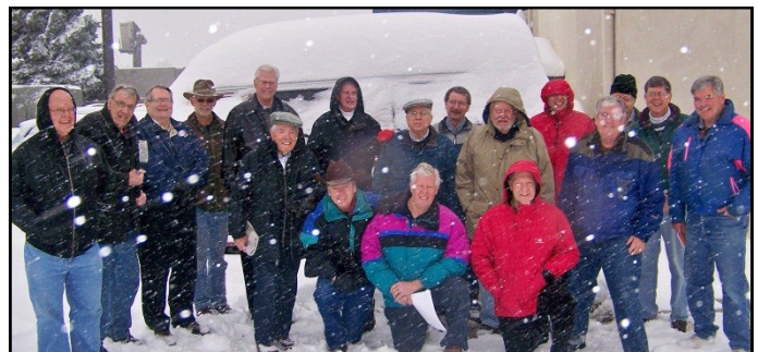
The hardy bunch, but of course some are missing.