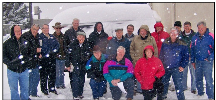
The hardy bunch, but of course some are missing.