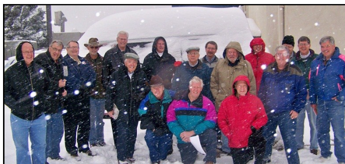
The hardy bunch, but of course some are missing.