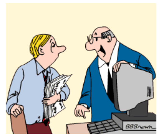
"THIS COMPUTER IS EQUIPPED WITH AN AIRBAG IN CASE YOU FALL ASLEEP!"