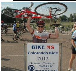
A rider from last years event.