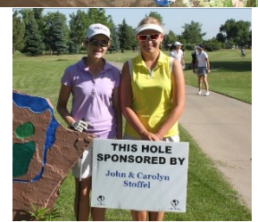
Two of the young girl competitors standing next to one of the many hole sponsor signs.