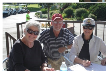
Tournament scorekeepers who cheerfully volunteered.