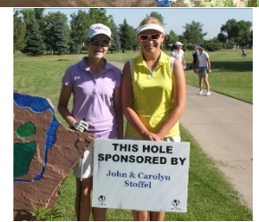
Two of the young girl competitors standing next to one of the many hole sponsor signs.