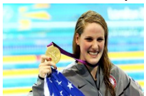
Missy Franklin wins Gold, Sets World Record on Night 7 at 2012 Olympic Games.