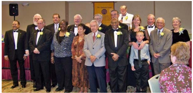
The new officers for the Colorado-Wyoming District 2008-2009.