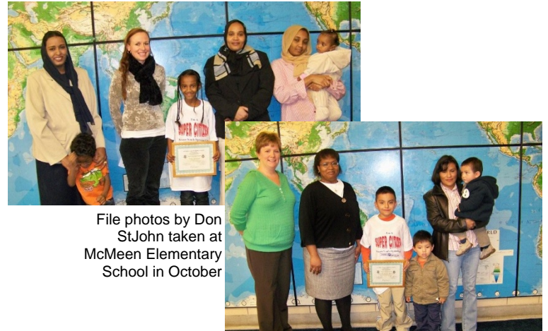
taken at McMeen Elementary School in October