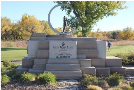
Green Valley Ranch Golf Club

To see photos taken at Green Valley Ranch, CLICK HERE .