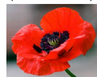
August's birth flower is Poppy.