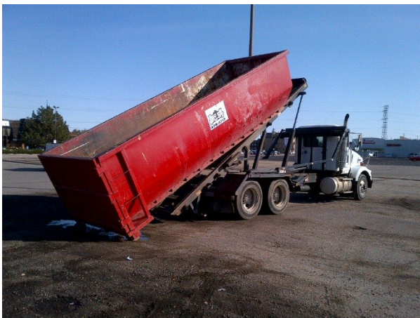
Delivery of the dumpster for at the lot.