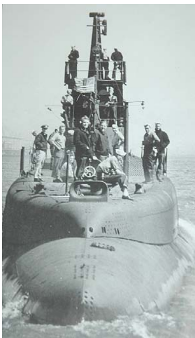
The U.S.S. Wahoo

Morton, however, preferred to go and seek out enemy ships and attack them. The Wahoo had a remarkable record of sinkings, and achieved a record for a submarine at that point in the war.