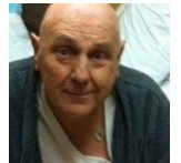
Dad and his Uncle Fester impression!