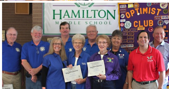
The Know Brainer Leadership Team from Tamarac & Monaco South Optimist Clubs