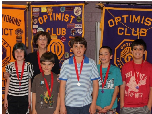
2nd Place Winner Southmoor Know-its