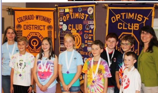
3rd Place Winner University Park Owls