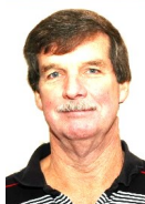
Pat Bush Photos Craig Eley