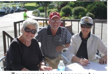
Tournament scorekeepers who cheerfully volunteered.