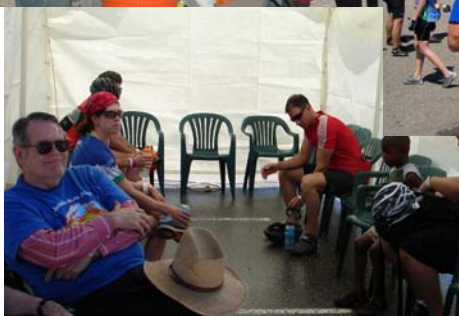
THE OPTIMISTER... "AS COOL AS A CUCUMBER"