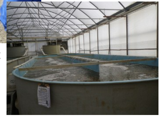
Below, one of many tilapia breeding and growing tanks.