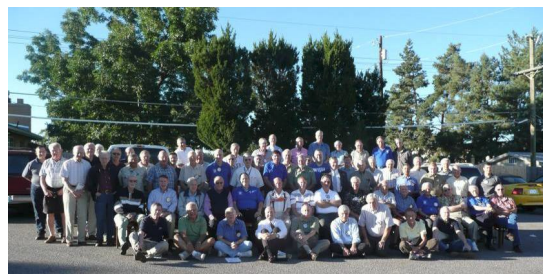
100% DAY 2007

100% Day, Friday, September 21st: Everyone is asked to be present for camaraderie, good fun, and a "Kodak Moment." If you want to update your looks from this 2007 100% picture, or just want to make the updated version, you need to be present for the 2012 take.