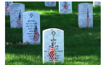
Cont. next page

The gravestones at Arlington National Commentary are graced by U.S. flags on Memorial Day weekend.