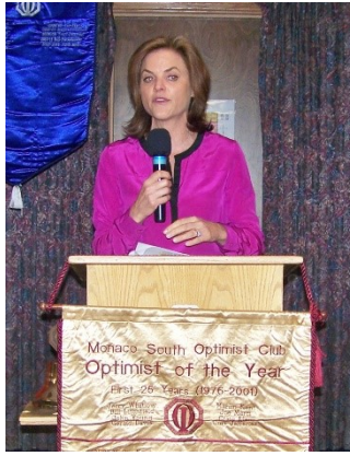
Kendra Black

The movement towards multimodal transportation will