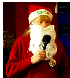
MSOC Santa Claus