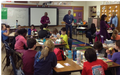
The JOOI Helping Hands Club charter meeting in February 2014.