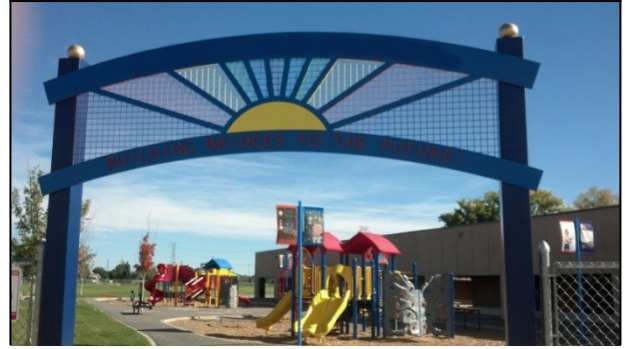
Signage Example: Optimist Club of Monaco South Playground

$35,000. Keep in mind, members who pledge over $1,000 ($200 per year for 5-years) will have their name on the plaque that will be adjacent to the entrance to the playground on the inside of the YMCA.