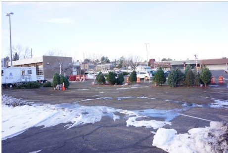
Last Tuesday, December 22, slim pickings.