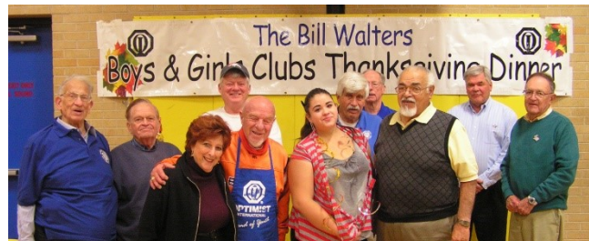
File photo from 2014's Boys & Girls Clubs Thanksgiving Dinner