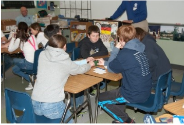
A brain bowl team gets ready to hit the buzzer and provide an answer.