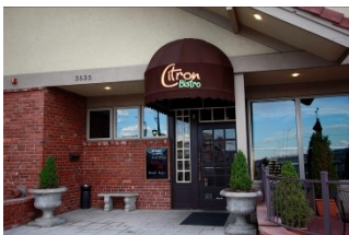
Citron Bistro

stated, this annual event is not to be missed. Bring your wife or sweetheart and join us for breakfast on Friday, February 14, at Citron Bistro (Yosemite and Hampden). Each year this event gets better and better, so this year