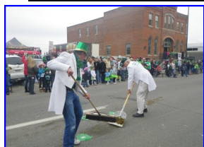
Only MSOC has the techniques for doing this the best! 2013 file photo